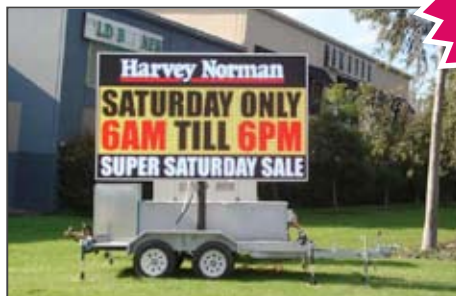
Harvey Norman Promotion Out-door screen on trailer Size: 1.95m x 3.2m Viewing area: 6.50sq.mtr