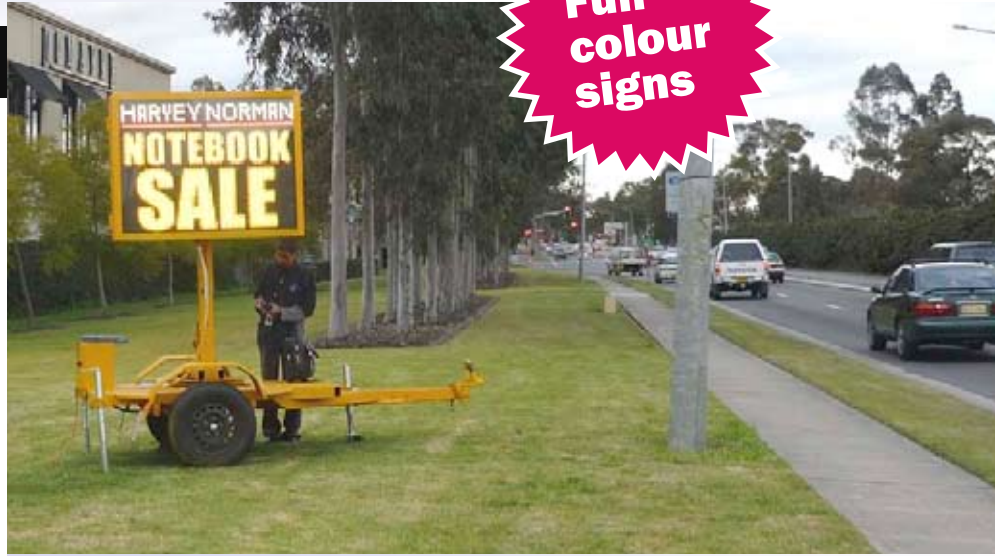
(VMS) on trailer – Size: 0.975m x 1.3m - Viewing area: 1.27sq.mtr (VMS) on trailer – Size: 1.45m x 1.95m - Viewing area: 2.86sq.mtr

Our high intensity signs deliver bright visible colour day and night enabling you to create powerful statements and get your message out