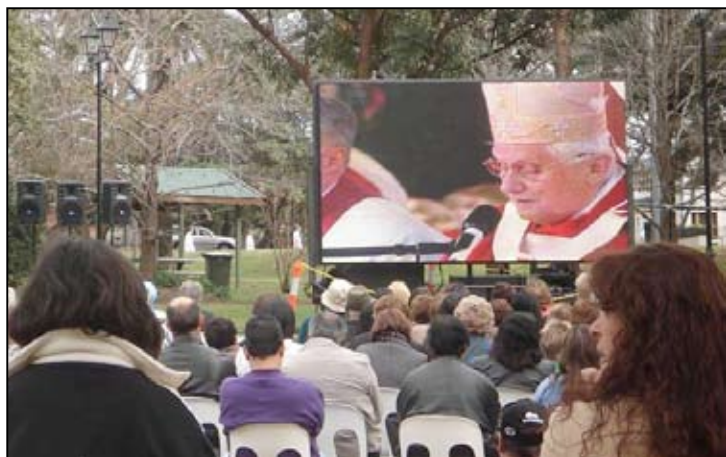
WORLD YOUTH DAY 2008 - Out-door screen on trailer Size: 4.55m x 2.6m - Viewing area: 12.00sq.mtr