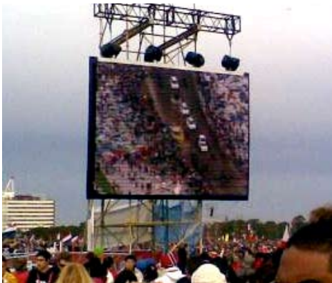
WORLD YOUTH DAY 2008 Out-door screen on scaffolding Size: 3.95m x 5.25m Viewing area: 20sq.mtr

Our video screens are custom built to fit almost any space. They are rugged, reliable and weather proof