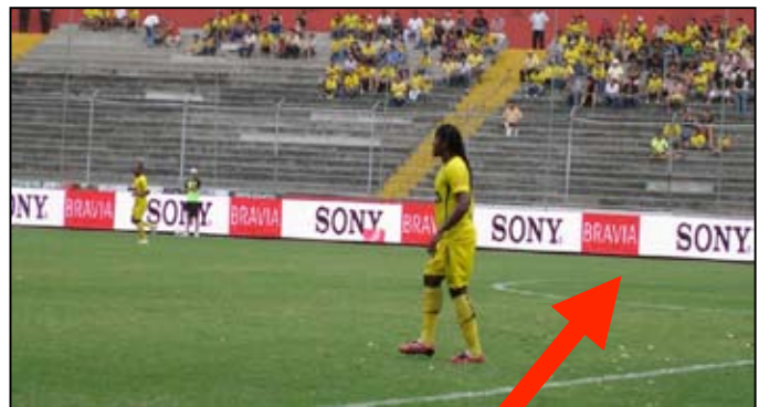
Adjustable self-standing structure

Perimeter signs can display video graphics and text with a variety of display effects like flashing and scrolling