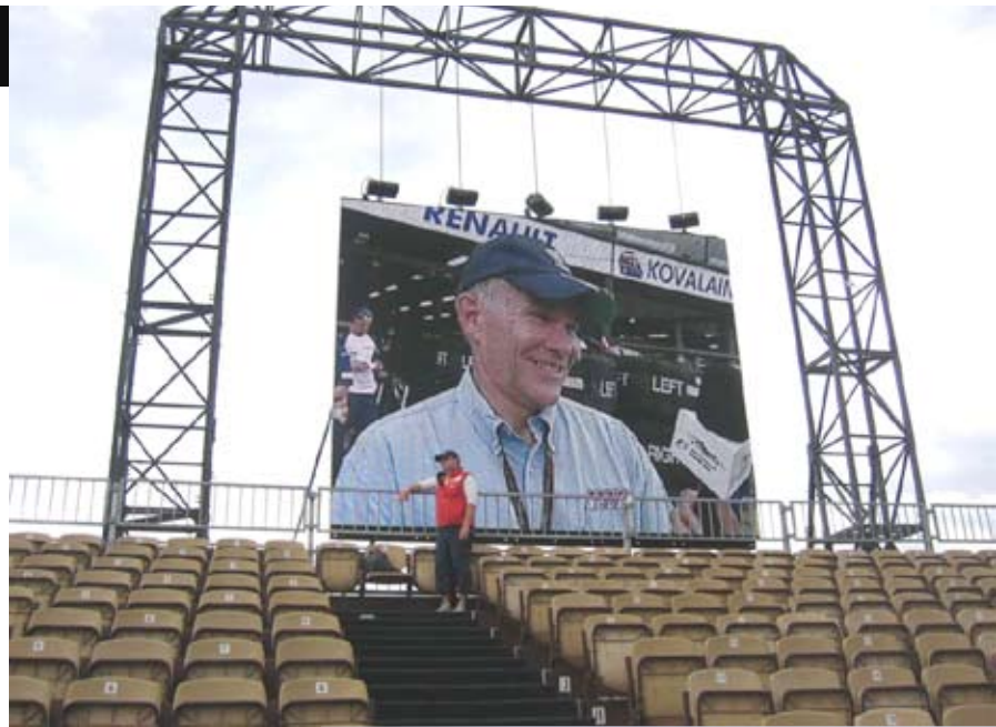
Grand Prix. 2007 - Out-door screen on scaffolding Size: 5.2m x 7.15m Viewing area: 38sq.mtr